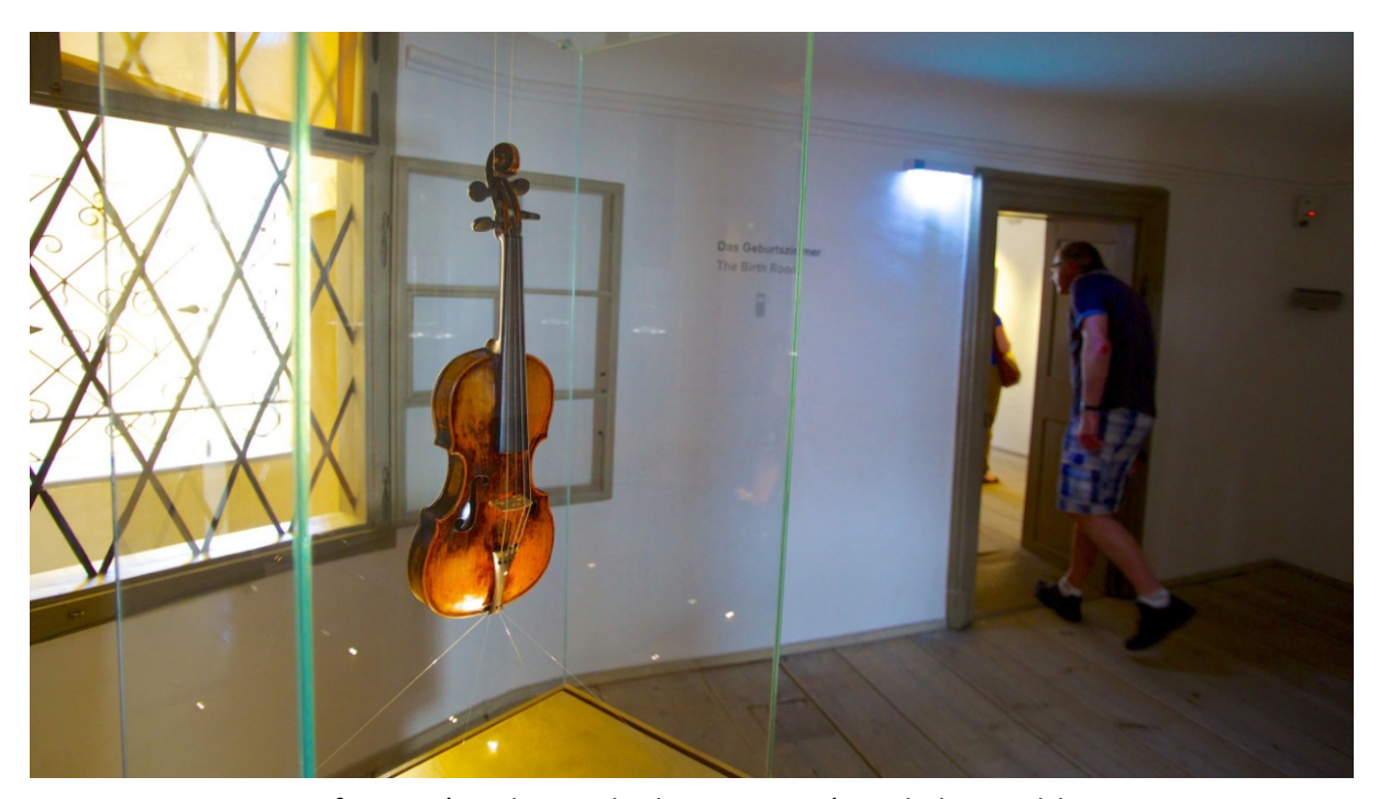
One of Mozart's violins on display at Mozart's Birthplace, Salzburg.

Hotel: Hotel Trend Europa Meals: Breakfast