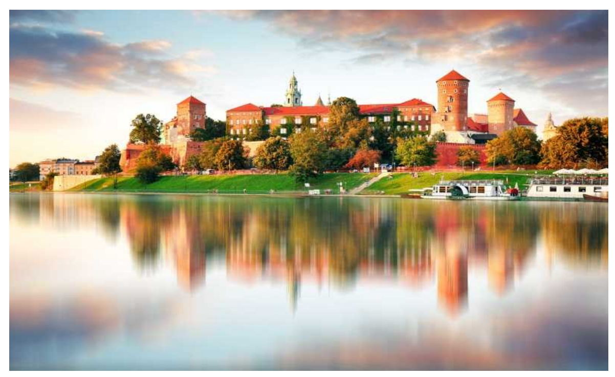
The Wawel Castle at Krakow

<u>Day 5, August 15th</u>: A somber morning as your group proceeds to its visit of the Auschwitz concentration camp. The visit will take up the entire morning and early afternoon, as Auschwitz is more than an hour outside Krakow. The rest of the day is free.