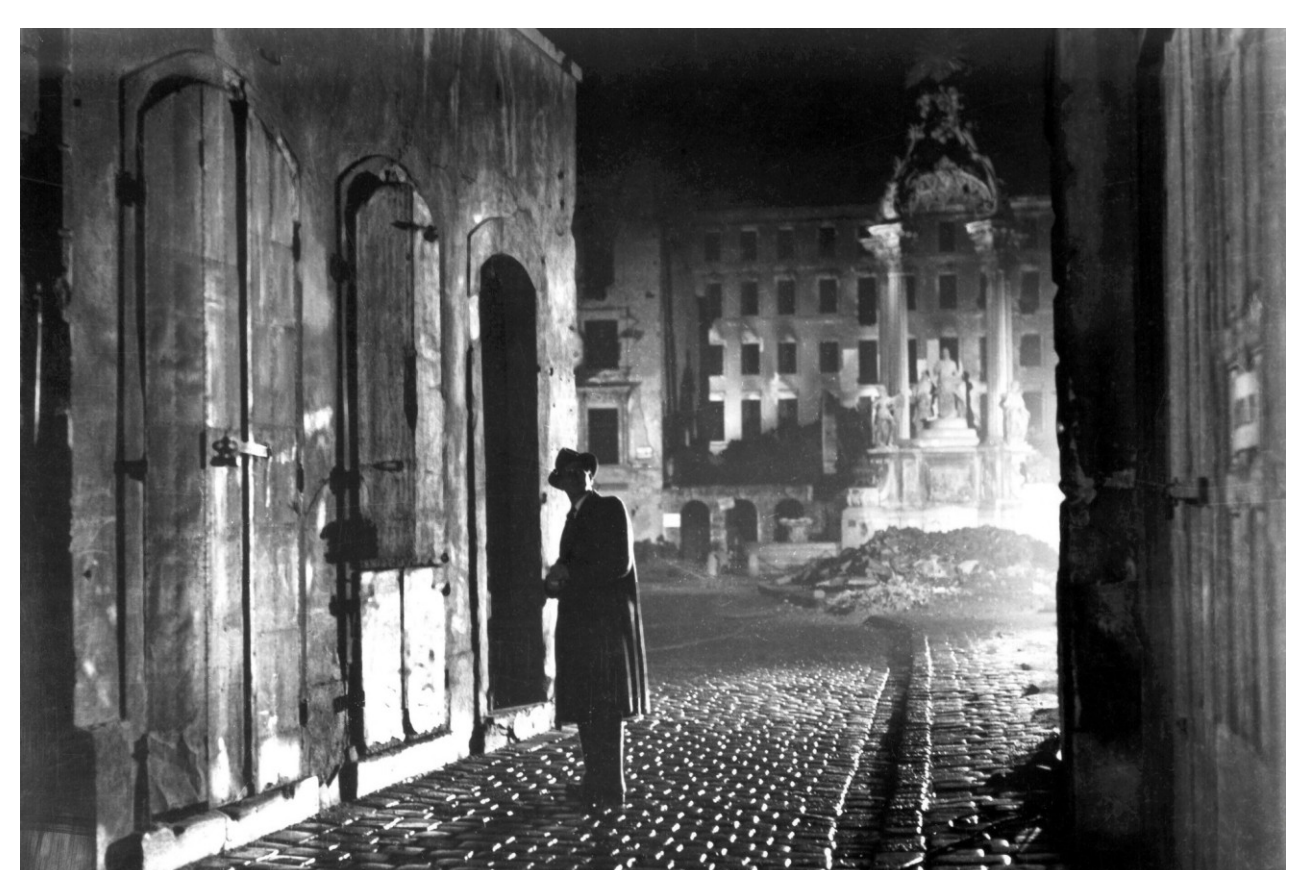
Joseph Cotten wanders the streets of Vienna in "The Third Man" (1949)

Hotel: Hotel Leonardo Hauptbahnhof Meals: Breakfast