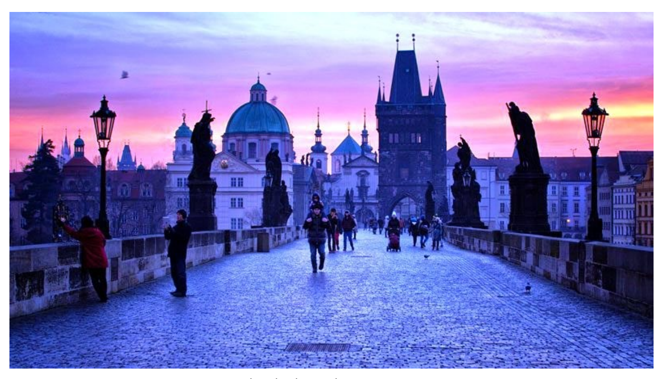
The Charles Bridge in Prague

<u>Day 2, August 12th</u>: Enjoy a leisurely morning on your own as you explore this wondrous capital city that was largely untouched by the ravages of World War II and which served as the filming location for the Oscar winning film "Amadeus." In the afternoon, you'll meet with a Local Expert who will take you on walking tour of the historical center and Prague Castle.