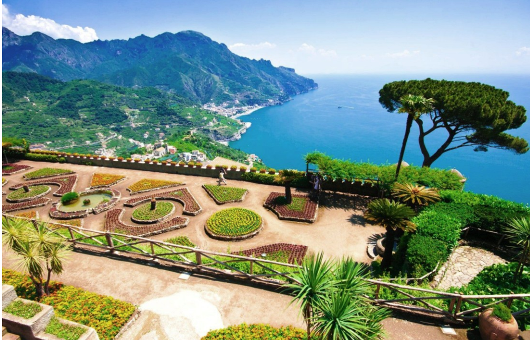
The views from Villa Rufolo in Ravello speak for themselves

Day 14, June 22nd: The final full day of the tour is a free day, except for the farewell dinner, which will take place at 8 p.m. Along the Amalfi Coast, there are many things to enjoy on your free day here. If you haven't visited Villa Cimbrone, we highly recommend a visit. You could look into the Walk of the Gods, a three hour hike across hills overlooking the coast. Nearby Atrani has wonderful beaches with amazing vistas. Or perhaps a lunch in Scala, the oldest village of the coast, is something to consider.