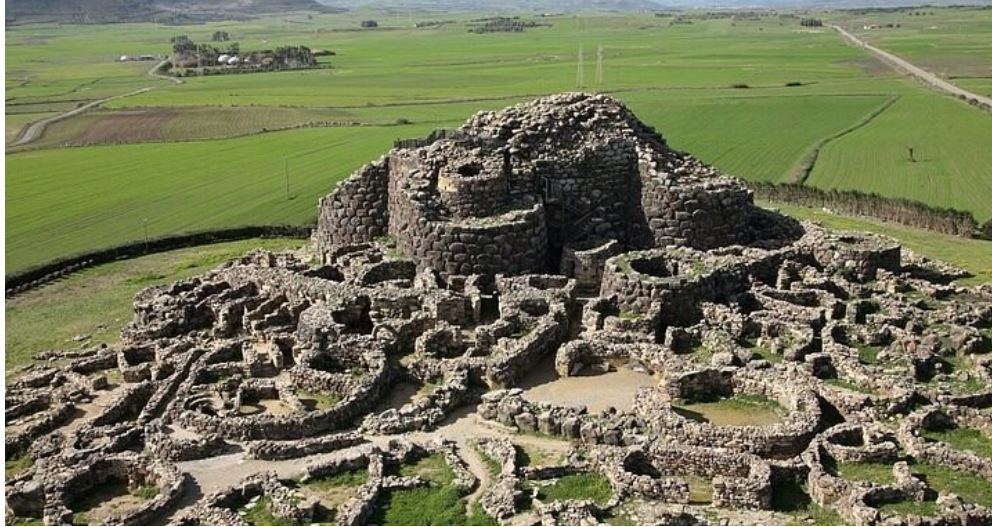
Modern day scholars still debate the primary function of the stone settlement known as Su Nuraxi di Barumini.

Day 9, June 17th : The first stop on our sightseeing path today is the town of Bosa, known for its colorful houses and hilltop fortress. Next, the group will enjoy a walking tour of Alghero, a coastal community with a rich history that includes Ozieri, Nuragic, and Phoenician cultures. Later we'll stop at Neptune's Grotto, a famous stalactite cave. Please be advised that there will be a lot of walking on this particular day and that we will descend a steep staircase to reach Neptune's Grotto.