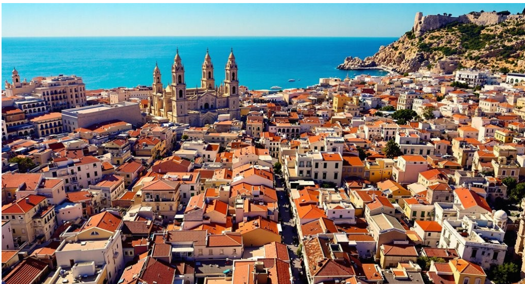
Adiosu, Cagliari! Finas a cando torrare a cumintzare!

Day 11, June 19th : "Until we meet again," as the saying goes! We hope you enjoyed your tour of Sicily and Sardinia. And you have the option of continuing your tour with us along the Amalfi Coast. Scroll down for the itinerary and information because you won't want to miss this!