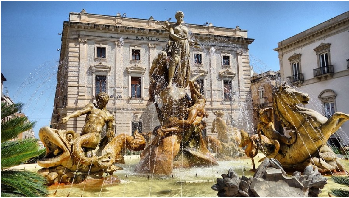
The Fontana di Diana in Siracusa features the goddess Diana with her hunting dog and bow.

Day 4, June 12th : Today, you'll bid a fond farewell to Taormina as your group makes its way across the island toward Palermo, the capital of Sicily. Along the way, the group will enjoy a visit to two ancient sights - the well-preserved Villa Romana del Casale ("Roman villa of the country") with its extensive Roman mosaics, and the monumental Valley of the Temples - an ancient Greek attraction.