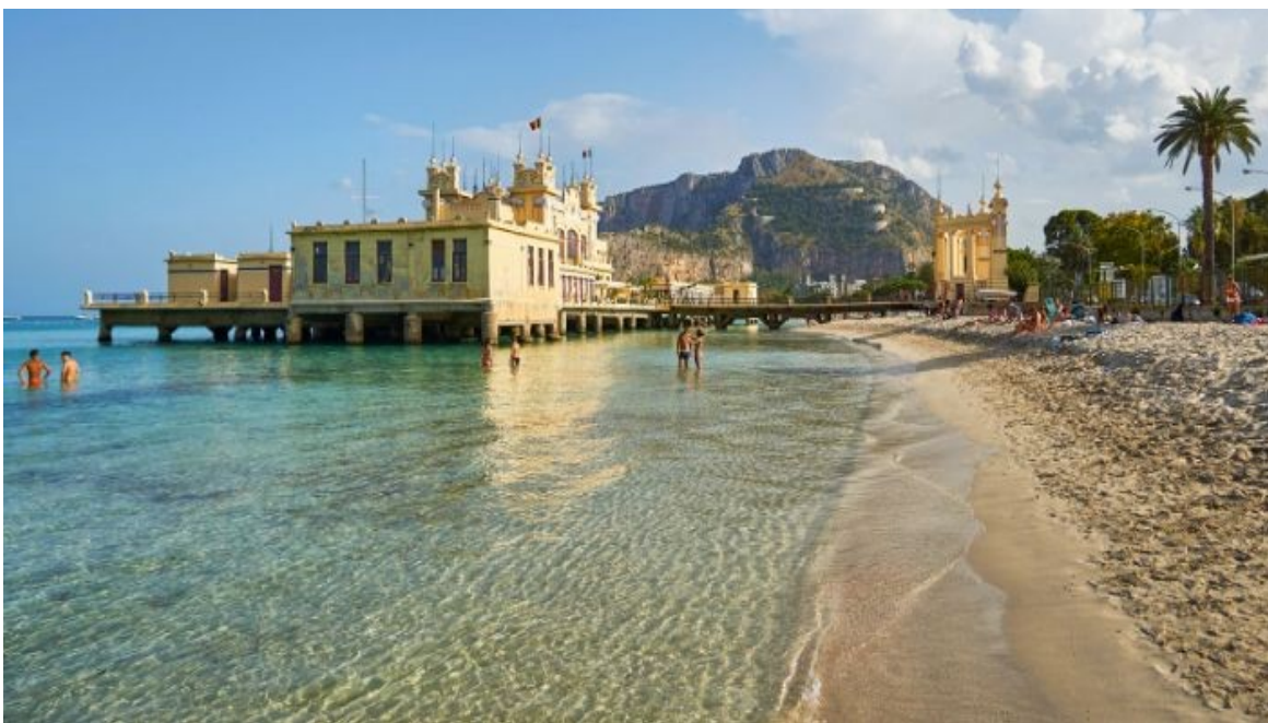
Mondello Beach in Palermo is only a ten minute taxi ride from the hotel