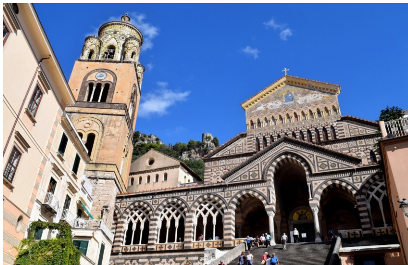
The Amalfi Cathedral houses the relics of Saint Andrew