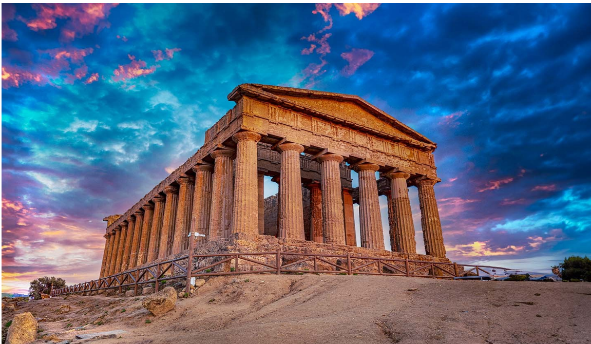
Built in the 5th century BC, the Temple of Concordia is considered one of the best preserved ancient Greek temples in the world