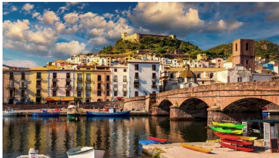
Bosa is a town you'll enjoy getting lost in