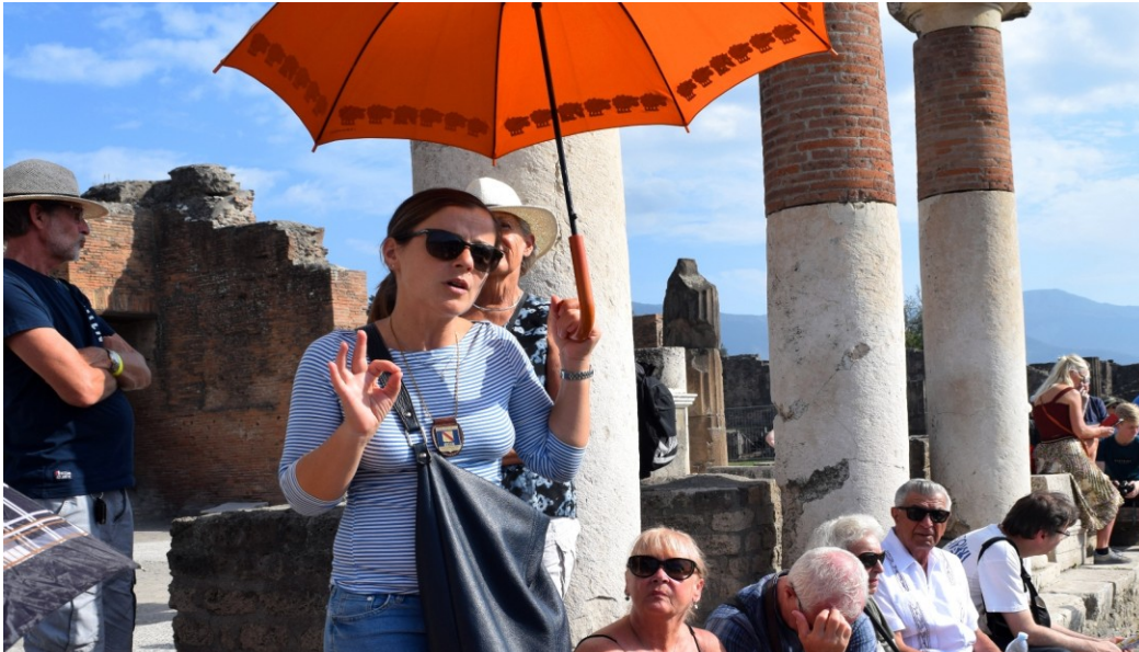
Your extended vacation includes a fully-guided tour of Pompeii.

Day 12, June 20th: Today, our tour will take us to splendid Positano for some truly picturesque views. Later, we'll have a walking tour of Amalfi, including a visit to the spellbinding Amalfi Cathedral, with its dizzying blend of architectural styles.