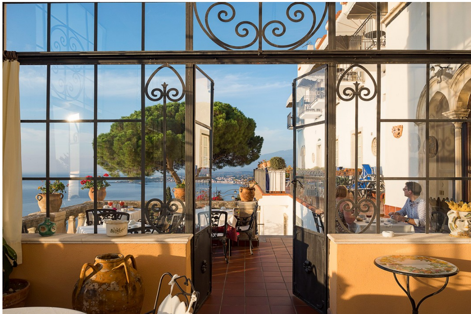
Hotel Bel Soggiorno in Taormina features wonderful views of the Mediterranean Sea

Hotel: Hotel Bel Soggiorno Meals: Dinner