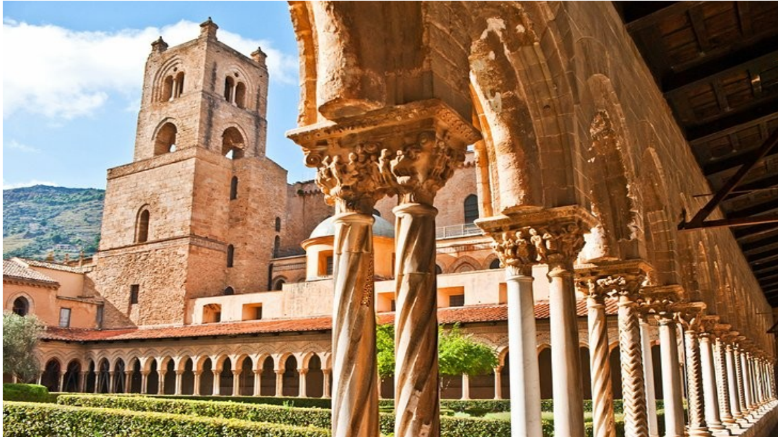
Constructed from 1172 to 1267, the Cattedrale di Monreale is considered one of the world's finest examples of Norman architecture